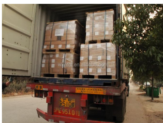
4. Professional placement