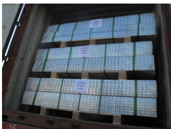
6. Complete package