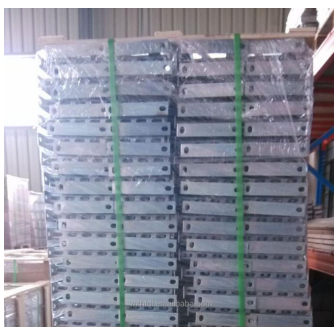
2. Suitable carton size