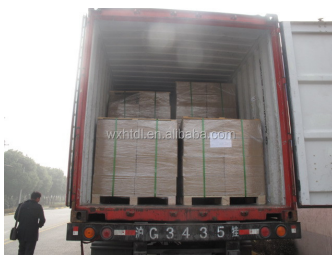
5. Professional shock