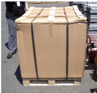
3. Shock bubble film