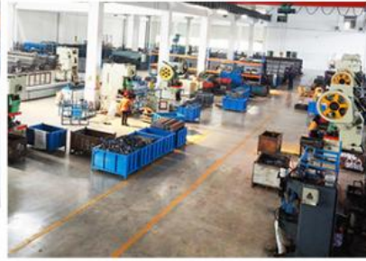
Stamping Workshop ▼