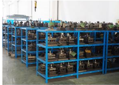
Mold Library ▲