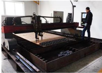
CNC Cutting ▲