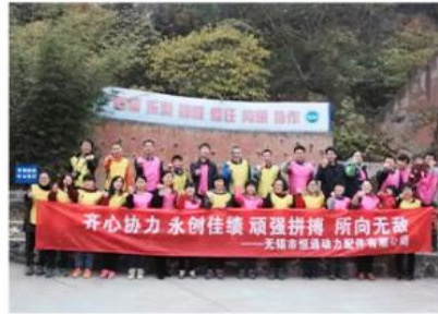
Our Team ▲