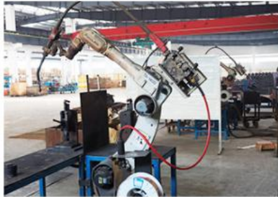
Welding Workshop ▲