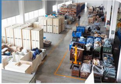
Packaging Workshop ▲

and America. We are experienced, professional, friendly, and eager to help with any need, from simple to custom manufactured products.